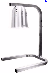
629-647 1 Bulb Heat Lamp $89.99 629-648 2 Bulb Heat Lamp $99.99