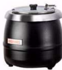
629-646 Soup Warmer Kettle $119.99