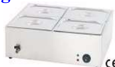
620-234 4 Pan Table Top Warmer $349.99