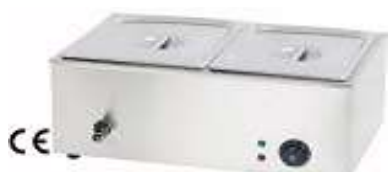
620-232 2 Pan Table Top Warmer $229.99