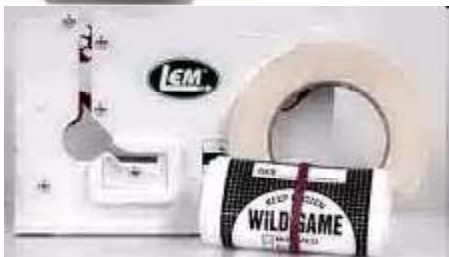
700-045 GROUND MEAT SYSTEM $35.99