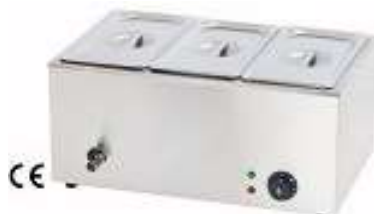
620-233 3 Pan Table Top Warmer $239.99