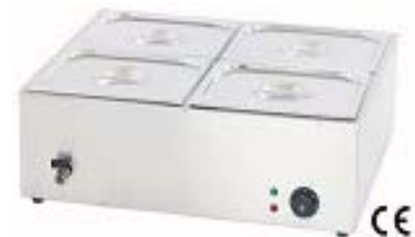
620-234 4 Pan Table Top Warmer $349.99