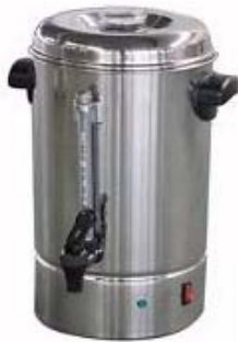
629-626 60 Cup Percolator $109.99 629-627 100 Cup Percolator $149.99

Refrigeration capability: 18-20 Quarts/ hour Hopper Volume: 5.8LX2 Dimensions: 24.4 x 30.4 x 36