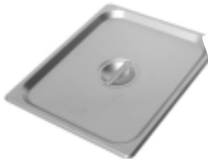
600-241 Half Size Notched Lid $9.49 629-637 Half Size Solid Lid $6.99