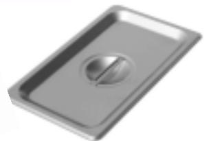
600-240 Full Size Notched Lid $10.99 601-504 Full Size Solid Lid $11.99