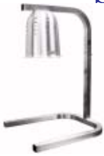
629-647 1 Bulb Heat Lamp $79.99 629-648 2 Bulb Heat Lamp $99.99