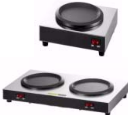
629-628 Single Coffee Warmer $59.99 629-629 Dual Coffee Warmer $79.99