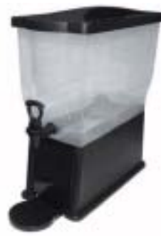
629-624 3 Gallon Plastic Dispenser $39.99