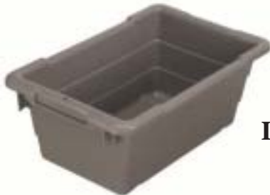
Meat Lug Lids are Available

Will Adapt to LEM Grinder Motors. Tilting feature is very useful and not available in most manual Mixers.