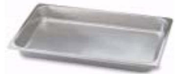
600-294 2.5" Deep Full Size Pan $14.99 600-237 4" Deep Full Size Pan $16.99 600-238 6" Deep Full Size Pan $21.99