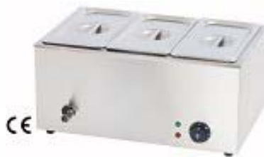
620-233 3 Pan Table Top Warmer $239.99