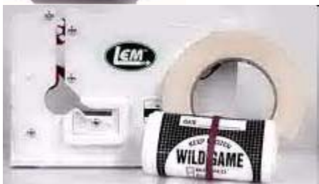
700-045 GROUND MEAT SYSTEM $35.99