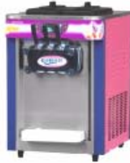
602-220 Ice Cream Freezer $2999.99

Voltage: 110V/60Hz Power: 1.6Kw Coolant: R22