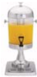
629-625 Juice Dispenser $109.99