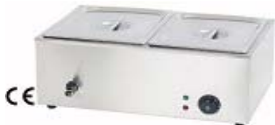
620-232 2 Pan Table Top Warmer $229.99