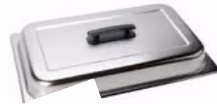
629-636 Full Size Dome Lid $29.99