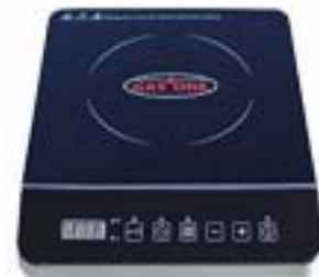
629-684 Induction Cooker $79.99