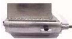
#600-298 Tenderizer attachment $449.99

"CS" STANDS FOR "CARBON STEEL" "G" STANDS FOR "MADE IN GERMANY" "SS" STANDS FOR "STAINLESS STEEL"