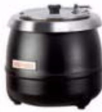
629-646 Soup Warmer Kettle $99.99