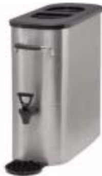
629-623 5 Gallon SS Slim Dispenser $139.99