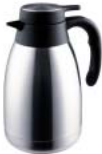
629-630 1 Ltr SS Coffee Carafe $19.99