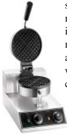
629-649 Waffle Maker

Made from heavy-duty stainless steel, this waffle maker is constructed to last in a commercial environment. The nonstick plates allow for easy removal of waffles and hassle-free cleanup.