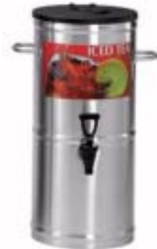
629-621 3 Gallon SS Dispenser $89.99 629-622 5 Gallon SS Dispenser $99.99